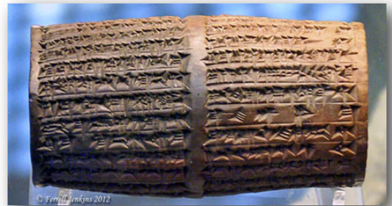
J.G. Taylor cylinder discovered in 1854. It describes Belshazzar as the son of Nabonidus.