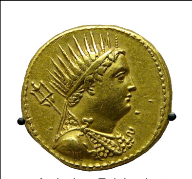
Antiochus Epiphanies personification of himself as the Greek God Zeus on the coinage he forced the Jews to use during his reign.